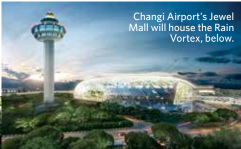
Changi Airport's Jewel Mall will house the Rain Vortex, below.