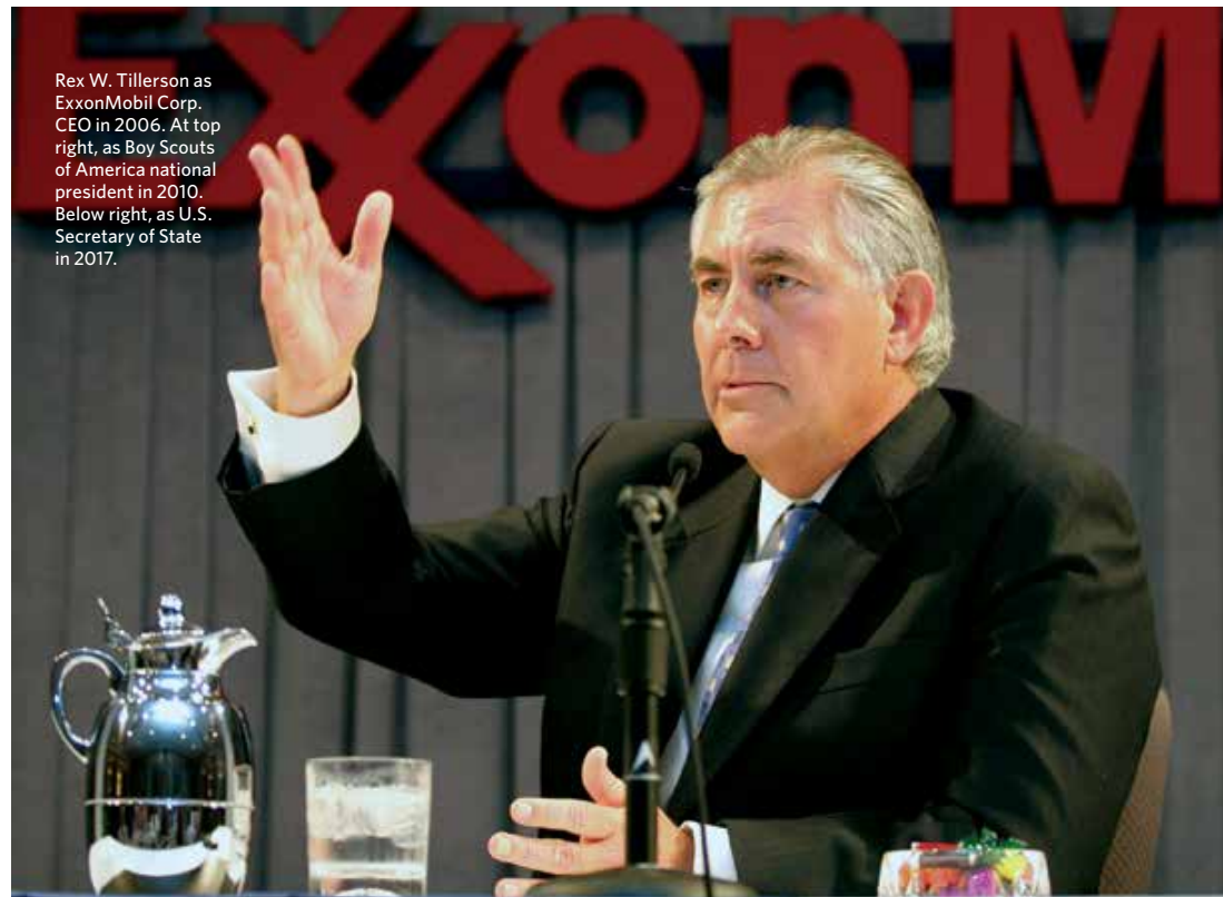
Rex W. Tillerson as ExxonMobil Corp. CEO in 2006. At top right, as Boy Scouts of America national president in 2010. Below right, as U.S. Secretary of State in 2017.

Your strategies don't change very much or very often unless you have some kind of an event like a breakthrough technology that just completely changes the nature of your business model and you have to respond to that. But by and large, your strategy is longer-term looking. They're how you align the entire organization.