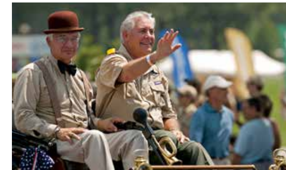
CLOCKWISE FROM TOP LEFT: PHOTO BY JASON JANIK/BLOOMBERG VIA GETTY IMAGES; COURTESY OF BOY SCOUTS OF AMERICA; COURTESY U.S. DEPARTMENT OF STATE

In the case of the Exxon and Mobil merger, it really was a marriage where the fundamental values were very similar. They were almost the same. The only differences that existed were Exxon was big and more disciplined in what we demanded of people than Mobil was. It